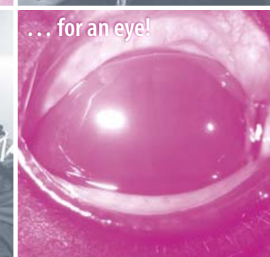
... for an eye!

March 29 – 31, 2019 · Muggenhausen / Heimerzheim, Germany