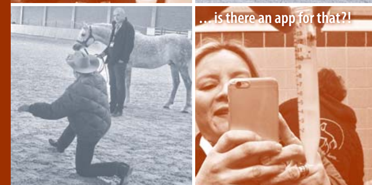
... is there an app for that?!

February 22 to 24, 2019 · Lüsche, Germany