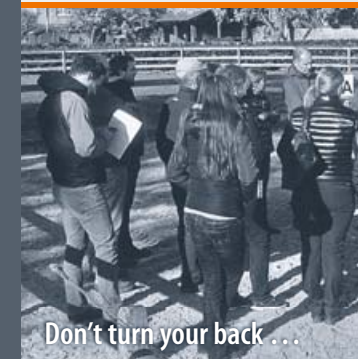
Don't turn your back ...

Practical diagnostic work-up and discussion of treatment options of orthopaedic conditions