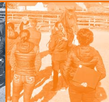
... on the facts on the back!